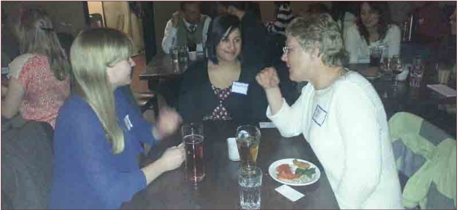
Students, new professionals and industry members at the BCFT Speed Networking event.

The first ever BCFT Speed Networking event was held on the 21st of March, 2013 at the SinBin! It was a joint event organized by the UBC Student Representatives and the New Professionals Committee.